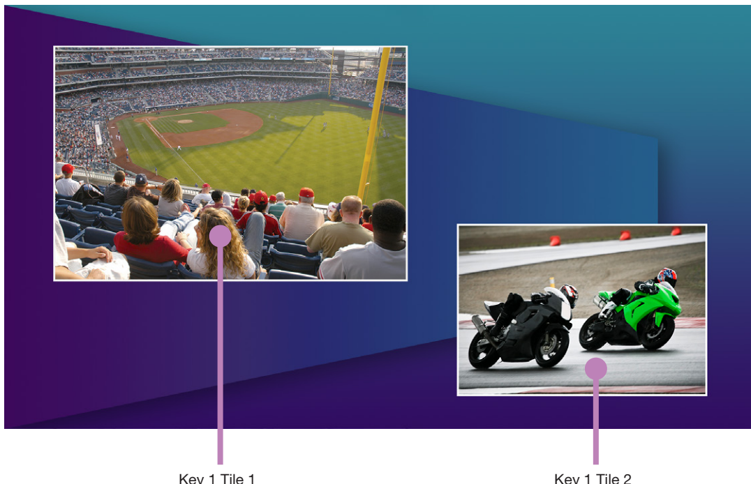
Key 1 Tile 1

The Masterpiece family also has a utility bus that can be used to load content from the internal ClipStores, allowing great-looking effects easily created when the squeeze backs are being used.